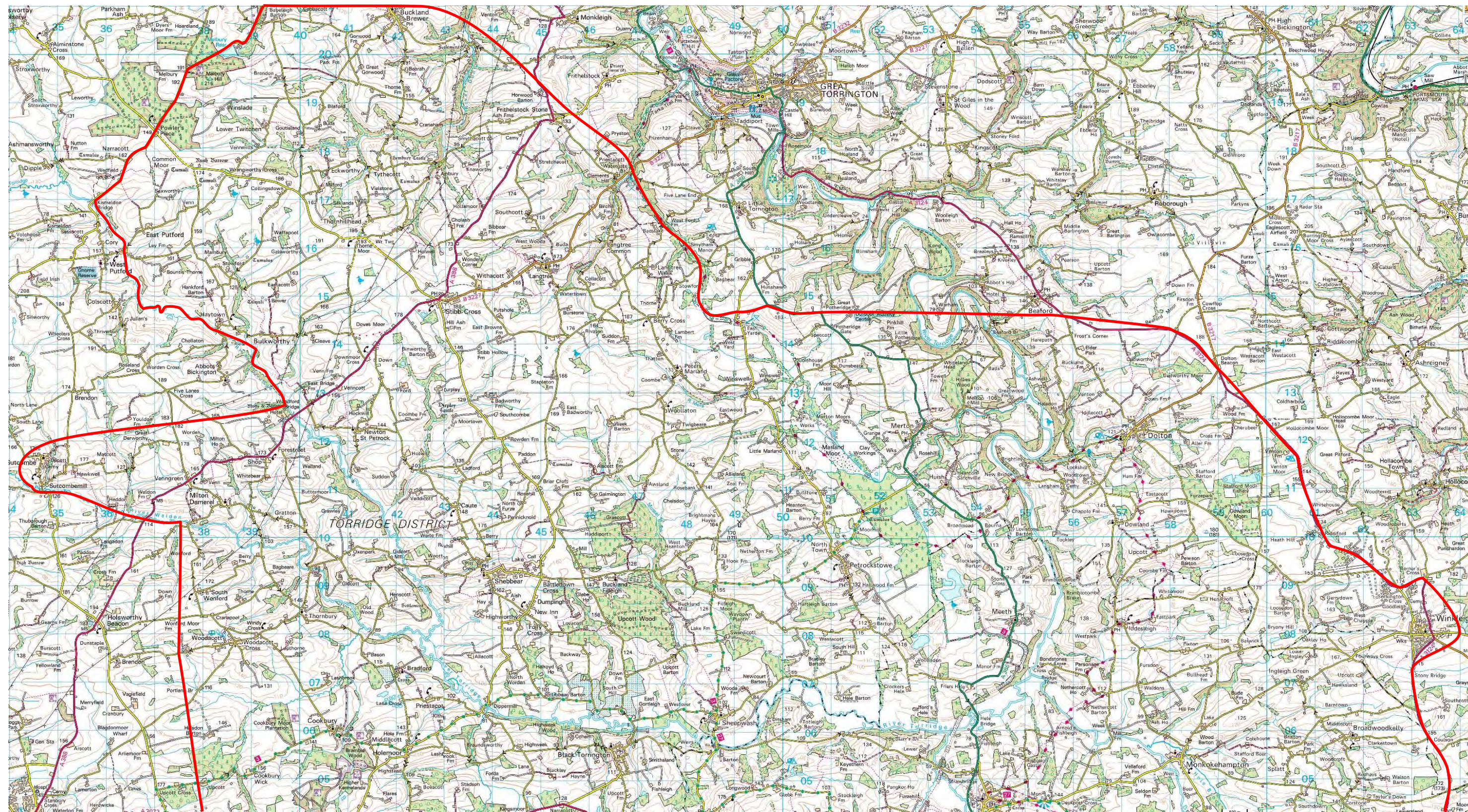
Holsworthy Medical Practice (RCMG) – Application for Outline Consent re new branch surgery in Hatherleigh: Map 1 (northern part)